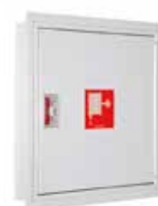
PV-142 and flush-mounting frame

The standard cabinet colours are grey (RAL 7040), white (RAL 9016) and red (RAL 3020). ● ○ ●