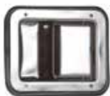
PV Lock device, stainless steel

Sturdy lock device for stainless steel cabinets