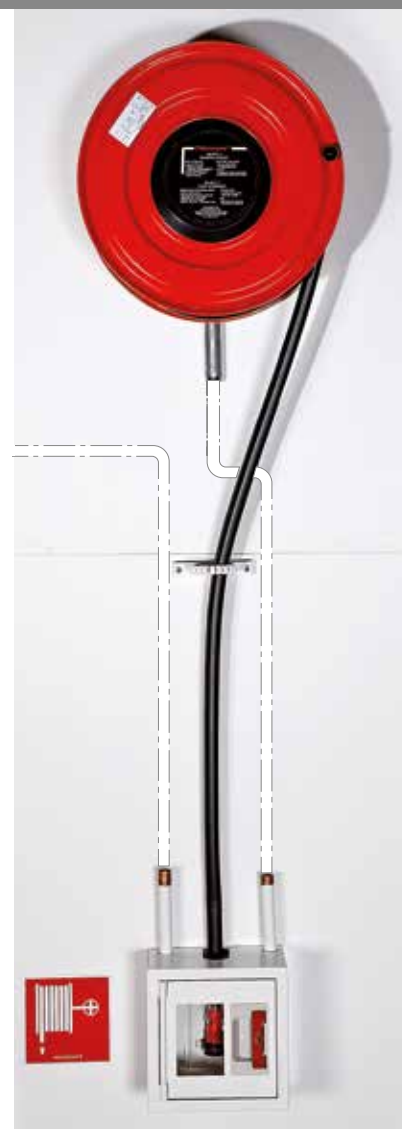
PV-23 hose reel and PV-7 SV pillar fire hydrant