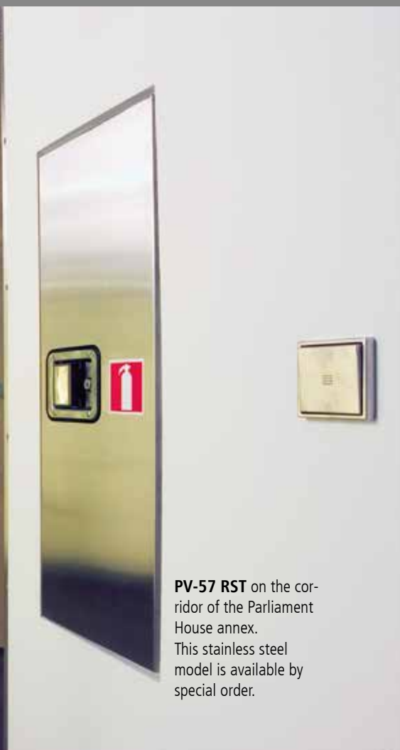
PV-57 RST on the corridor of the Parliament House annex. This stainless steel model is available by special order.