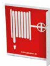
PV Angle bracket (3276210) with PV Fire hydrant label attached (3276207)