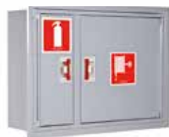
PV-102 and flush-mounting frame