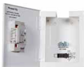
PV-7 IV Mini