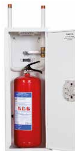
PV-57 SV and extinguisher Extinguishers on page 23.