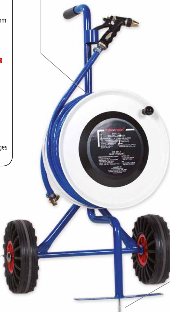
Watering cart PV-75