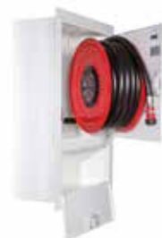
PV-202 and flush-mounting frame

The standard cabinet colours are grey (RAL 7040), white (RAL 9016) and red (RAL 3020). ● ○ ●