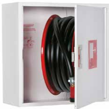
PV-10 and flush-mounting frame